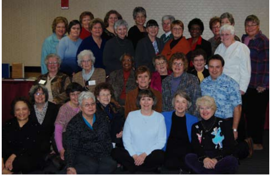
High scorers! The 28 members of the 2009 Parliamentary Training Seminar and their instructors enjoy the end of their intense studies during a weekend of classes.