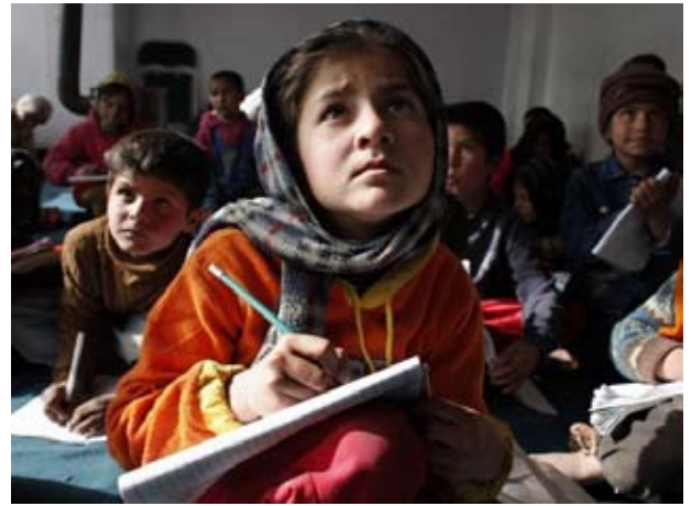
Afghanistan girls are eager to learn and have the tools to make learning possible.