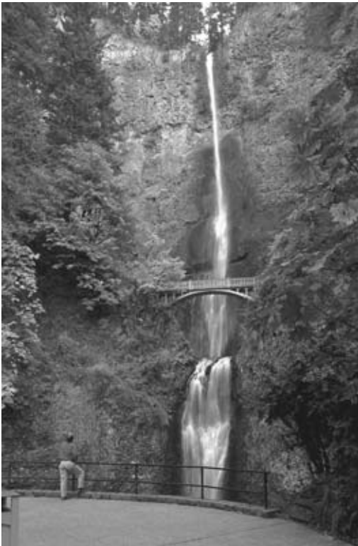
Full-day Tour #1 Columbia River Gorge Waterfalls