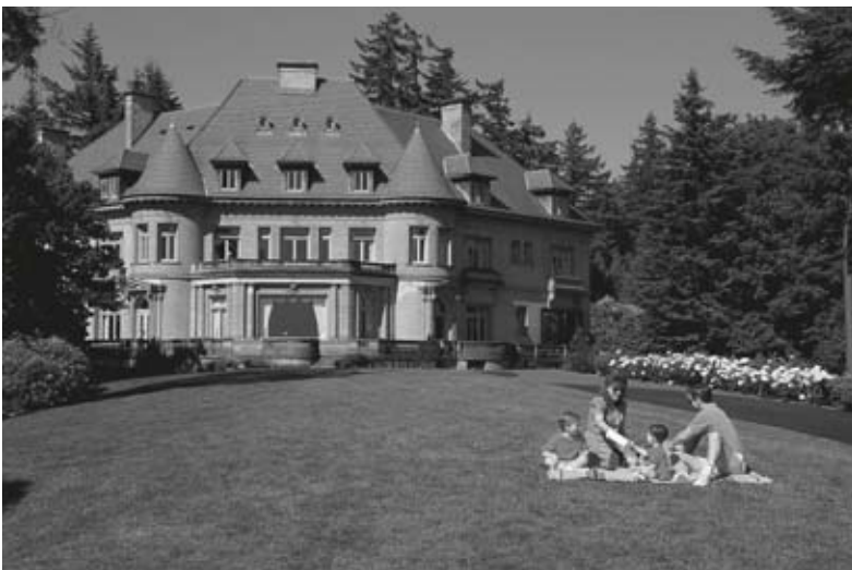
Half-day Tour # 10 The Pittock Mansion