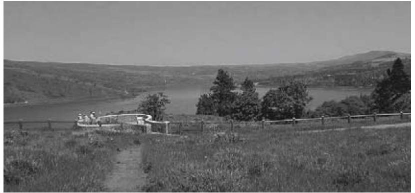
Columbia River Gorge