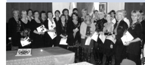
In October Iceland installed Lambda Chapter in the region around Reykjavik, the new chapter has 26 members.