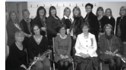
Sweden celebrated the installation of Lambda Chapter in Karlstad October 21, 2010, with 12 new members.

Congratulations to Sweden and Iceland on their new chapters!