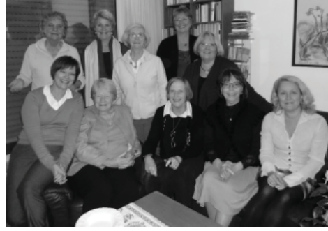
Members of the European Forum smile when their meeting had ended successfully

We are delighted to see that Denmark has a new Web site – this can easily be accessed through the weblink above to the European Web site.