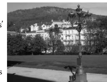
The countryside of Baden-Baden awaits all who attend.

Accommodations will be in single or twin-bed rooms at our college venue, or in nearby guest houses/hotels where we have block bookings.