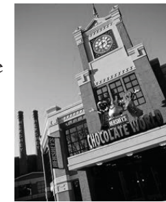
Hershey, the chocolate capital, beckons all.

A vast array of breakout sessions awaits participants. Trying to select a workshop in each time slot will be a sweet dilemma. One day the majority of workshops will focus on "Education in the Digital Arena." Come and learn how "new technologies" will assist in designing the future.