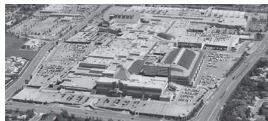
Fantasyland Mall hosts the Northwest Regional Conference with something for everyone.

The conference takes place on one floor of the Fantasyland Hotel. Guards patrol the hotel and mall,