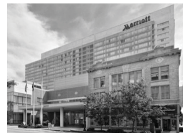
Gather at the Marriott Louisville Downtown for fun and festivities.

The conference site, the Marriott Louisville Downtown, connects venues of entertainment by an enclosed lighted walkway. The hotel offers the famous BLU Italian Grill and the